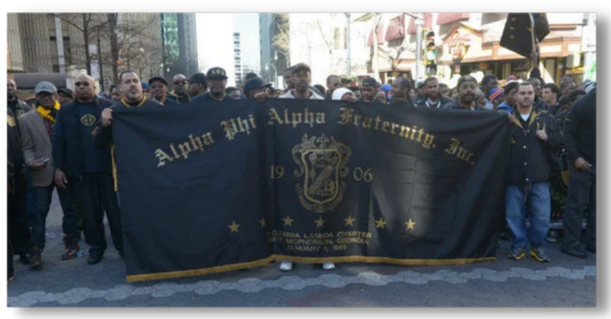
PHOTOS: BLACK GREEK ORGANIZATIONS MARCH FROM CITY HALL TO THE AFRICAN AMERICAN MUSEUM