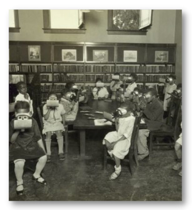
CHERRY STREET LIBRARY