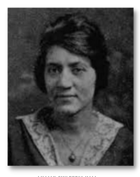
LILLIAN CHILDRESS HALL