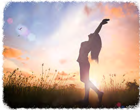
Southwestern Behavioral Healthcare meets the licensing and accreditation standards of the Indiana Division of Mental Health and Addiction and is Joint Commission Accredited.

We collect data from those served in our programs to help determine the areas in which we are making an impact. This data has shown, with solid statistical significance, that those completing our programs leave with greatly improved self-esteem, better decision-making skills, and expectancy that they will not use substances again. In addition, our clients report improvement in any co-occurring symptoms they initially presented. We know our program is helping our community because our community is telling us that it is. Together we can improve your life or the lives of the ones you love. We hope you'll take this journey towards recovery with us.